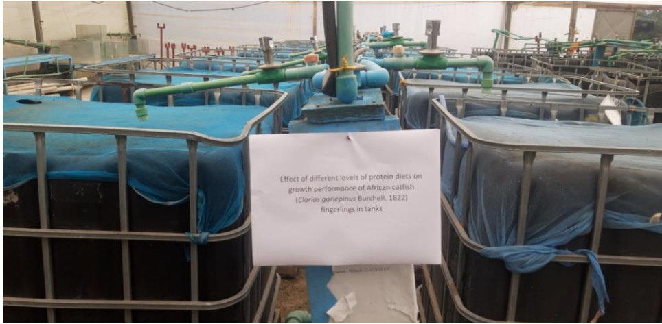
Plate 1. Photo showing the experimental setup of recirculating tanks in green house at NFALRC.

C. gariepinus fingerlings raised artificially in the centre were used for the feeding experiment. The feeding trial consisted of three treatment groups; fed with three feeds of protein diets containing 30% CP, 35% CP and 40% CP. Twelve fish fingerlings having similar sizes were stocked per tank. At the beginning of the experiment total length and total weight of all fish were measured to the nearest 0.1 cm and 0.1 g, respectively. Similarly monthly TL and TW of all fish were recorded and the daily ration was adjusted accordingly. Fish were fed with test diets at 5% of their total body weight for six days a week, except Sundays. The daily ration was given twice a day by hand casting, in the morning (10:00 am) and in the afternoon (4:00 pm). The daily ration was calculated and adjusted regularly following the monthly weight gain of the fish. Mortality of fish was monitored and recorded continuously throughout the experiment.