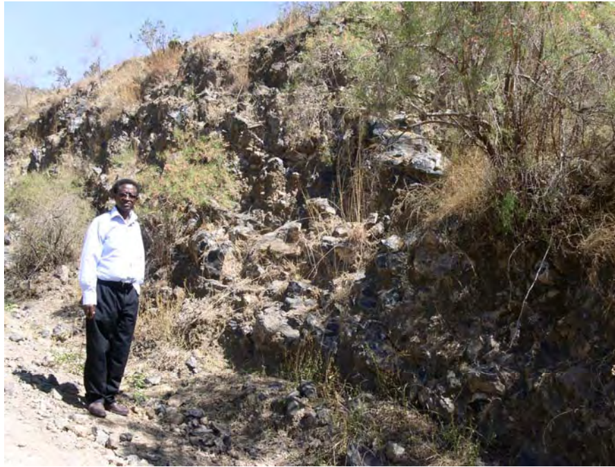
Fig. 3. Obsidian flow from Alutu volcano.