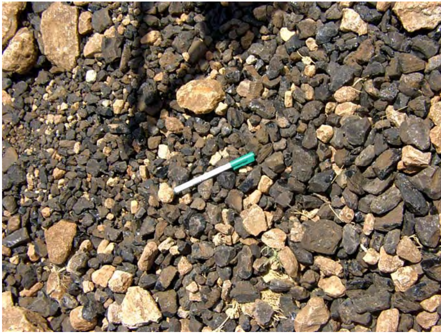
Fig. 2. Obsidian pebbles from Worja locality.

A second potential obsidian source which we sampled is Bericcia volcano ( 8.0444^{\circ} N, 39.0178^{\circ} E), near the small town of Ogolcho. Volcanism in the Bericcia area is part of the Main Ethiopian Rift volcanic complex along the Langano-Ziway segment of the WFB and, as at Alutu (see below), is characterized by rhyolitic lava flows, domes and pyroclastic rocks including pumice, tuff, obsidian and pitchstone. Patches of obsidian/pitchstone are common within one rhyolitic flow unit in the Ogolcho-Bericcia area. The obsidian (pitchstone) is generally non-vitreous, black, and found intercalated within rhyolitic ignimbrites that are generally light grey, vesicular, and in some cases flow banded.