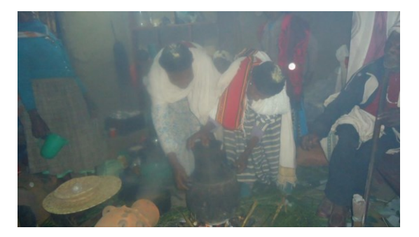
Figure 3. Jaaloo for Ateetee (Porridge)

On this festive event, Oromo mothers are even held dedicated to making bread (harvesting days) and to the ritual of cutting the green grass for ritual to pray to their Waaqa around sacred place in their respective areas. This ceremony is performed on the eve of Irrecha thanksgiving. They were also performing praying to their Waaqa by carrying ulfaa , ritual bead and siinqee , ritual stick. The wadaaja feast is performed by women mainly to worship Ateetee , the goddess of fecundity, and other deities and goddesses; the ritual leader is usually a man.