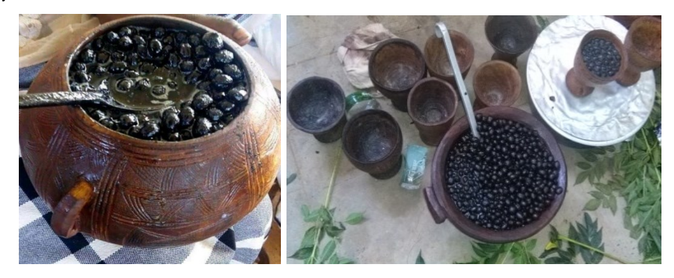
Figure 4. Buna Qalamee (Slaughtered coffee) with butter and ready to be eaten

Coffee also symbolizes women among Oromo in the area. The butter added to the buna qalaa has a strong symbolic relation with women and women fertility among Oromo in Jidda which performed occasionally in October.