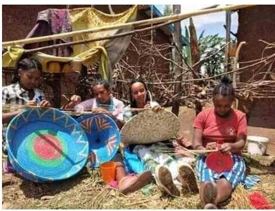
Figure 5. Making handicraft

Handicraft products are also others oldest heritages in the area. They area is known by tradition of crafts with precious values, created for centuries by masters of folk. The most known handicrafts in in Jidda district are works in wood, basketry, stone and horn carvings as well as pottery and ceramics producing. The area is also known by producing crafts from animal bone, horn and skin and Plants. They are a constant source of inspiration for contemporary designers and the subject for global exhibitions representing Oromo cultural arts.