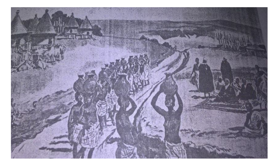
Figure 2 welcoming ceremony to armies of Fitawrari Habte Giorgis by Konso people in 1897