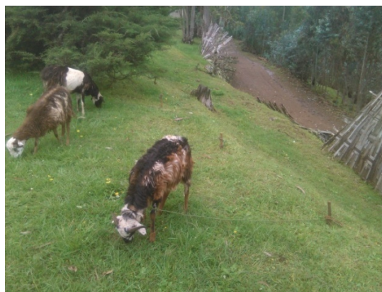
Figure 1: Local Gamo highland sheep eco-type grazing by tethering.

About 10 yearling improved Bonga rams were distributed for ram user groups. Sheep in the study areas depend largely on communal grazing by tethering. The disseminated rams were supplemented with locally available feed sources (barley, inset and home leftovers) along with grazing by tethering.