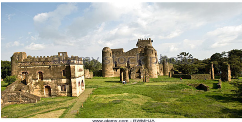
Figure 1: The Gondarine castles at Fasil Gibbe

Among many of the igniters of Gondarian urbanization, one finds castle as castles were the magnets of urbanization (Biru, 2016) and thus the city of Gondar is the by-product of castles and churches. The construction of the castle or Bête Mengist [house of governance] was the principal trigger for the emergence of Gondar. The castles were built in an area between Angereb and Qeha rivers - surrounded by several churches and residences of the echege [The head monk of EOC] (Kasssa, 2010). The royal enclosure was residential for the royal families and their servants. E. Isaac (2012) commented that castles served the Ethiopian empire to organize monarchical institutions through which the kings discharged their responsibilities.