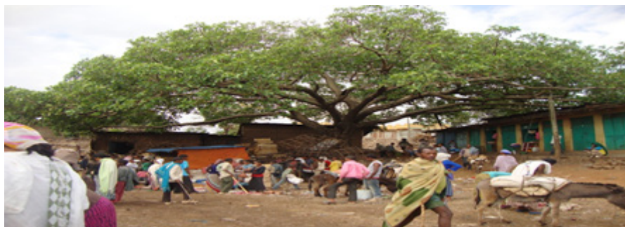
Figure 3: A model to show the function of the market

Here, it is easy to extrapolate that market transactions, occupation, and production of some items were reflected through religion and culture. For example, Muslims were socially recognized for their weaving. On the other hand, pottery and metal works were left for the Felashas while retailing was for Muslims.