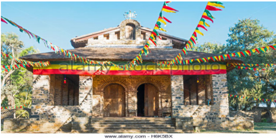
Figure 2: Debre Brihane Sellassie Church

Durkheim (1912/1995) defined religion as a system of practical belief that unites people who adhere to it through (Weber (1920/1963: 29). The Gondarian royal enclosure was a center for the churches that was built to unite and congregate people. With the expansion of the city boundary, the churches were also built in relatively far places to the city center near the palace. Among the forty four churches, some were engulfed by the physical expansion of the city.