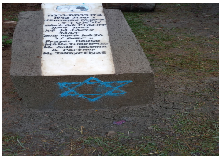
Figure 4: Falasha Residence Area at Gondar (Own Model, 2018)

Tolossa (2010) discussed that the migration of Jews to Ethiopia took place when Ethiopis, the grandson of Jherto came carrying the replica of the Ark of the Covenant while the second migration of the Israel's 12 tribes ensued Minlik to Ethiopia with real Ark of the Covenant. Thus, Tolossa argued that Jews and Ethiopians share the same cultural history to the extent of worshipping the same God. At the end of Gondarian period, the Falashas have lost their relevance due to the disjuncture of the building activities. Nevertheless, their importance in crafting pottery and smiting remained vital even after the decline of the Gondarian period.