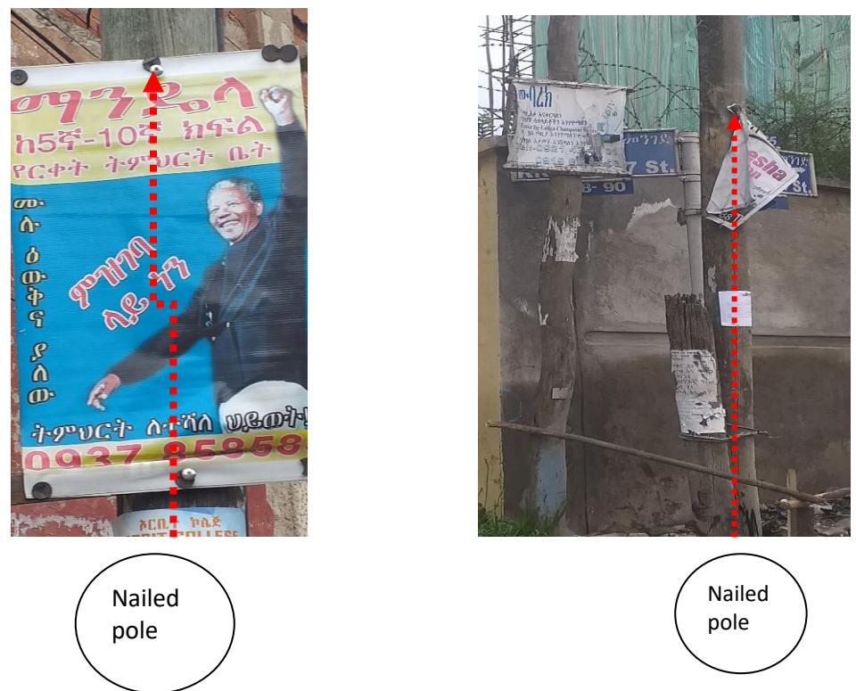
Fig. 6: Nailed, congested, and messed posters in Addis Ababa

Badly nailed poles are often likely to cause considerable damage to the environment and pose a threat to pedestrian safety if the nails fall to the ground. We can see from the second picture above that it is on the verge, despite the fact that it is heavily nailed to the pole. In addition, the text is upside down and the intended message is barely consumed. Basay and Eteng (2021) highlight that the issue also persists in Nigeria. They argue that posters and banners are commonly seen on the walls of residential and public buildings, fences, bus stands, electric poles, kerosene tanks, and even on previously mounted advertisement boards.