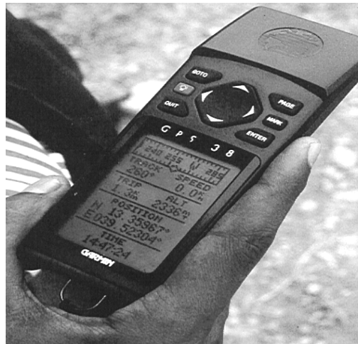
Figure 1: Hand-held GPS receiver, in use at position 13.35967 °N and 39.52304 °E