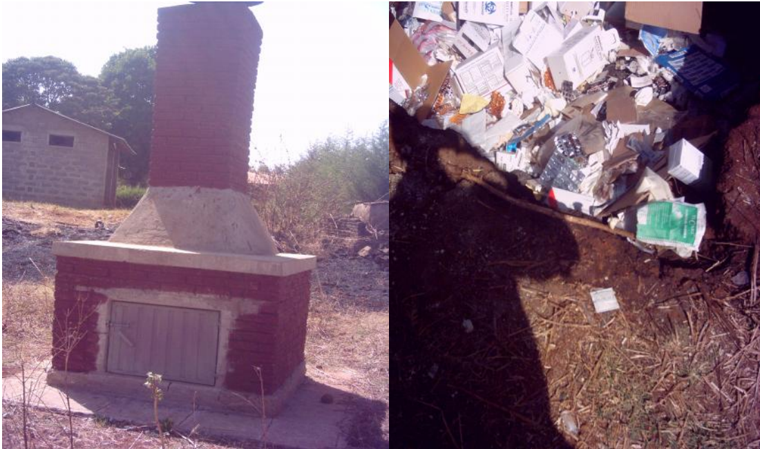
Figure 1: Newly constructed incinerator for HCW disposal and mixed disposal of HCW with open pit in study health centers.

Pathological waste was handled in a non-water tight placenta pit, of which four out of ten health centers had their slab from earthen-mud while others had concrete floor (Figure 2). Free flowing liquid waste emanating from wards, laboratory and delivery rooms was simply disposed into hand washbasins that are connected to septic tank.