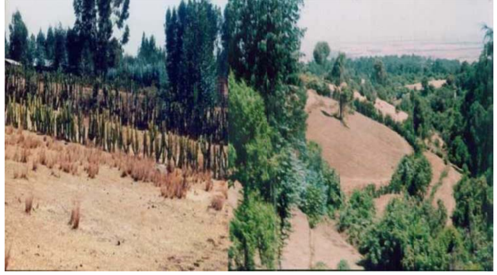
Table 2: SWC Conservation Practices in Kasso Catchment at Different Elevation Categories

Figure 5: Living fence of various tree species