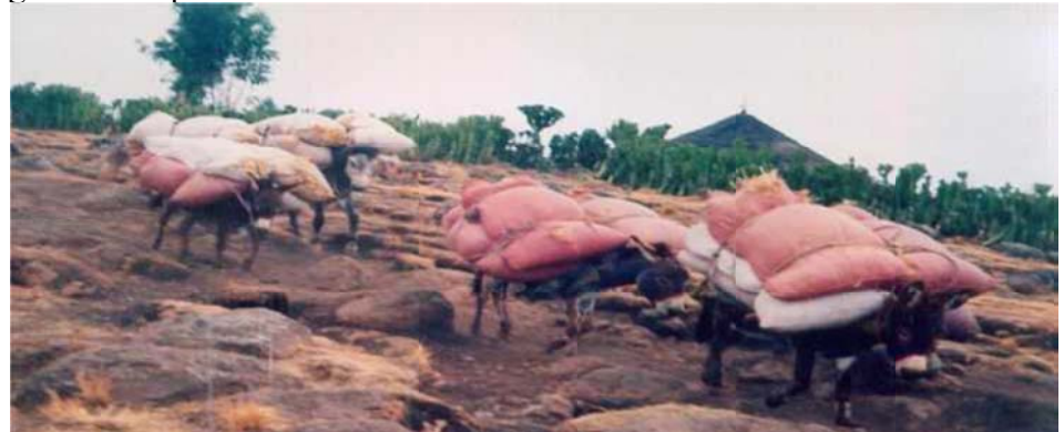
Figure 6: Crop Residues for Sale in Towns