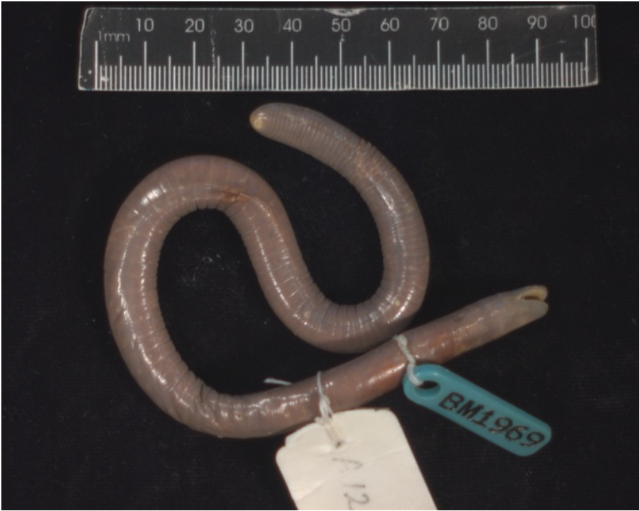
Fig. 3. Holotype of Sylvacaecilia grandisonae (Gymnophiona), BM 1969.1589. The Natural History Museum, London.