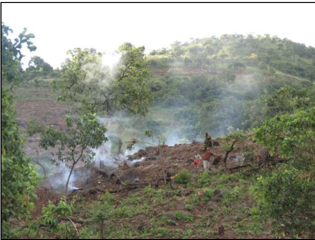
Fig. 2. Protected swampy grassland and forest amphibian habitat in the Bale Mountains (top), and habitat degradation in the southwest highlands (bottom) in Ethiopia.