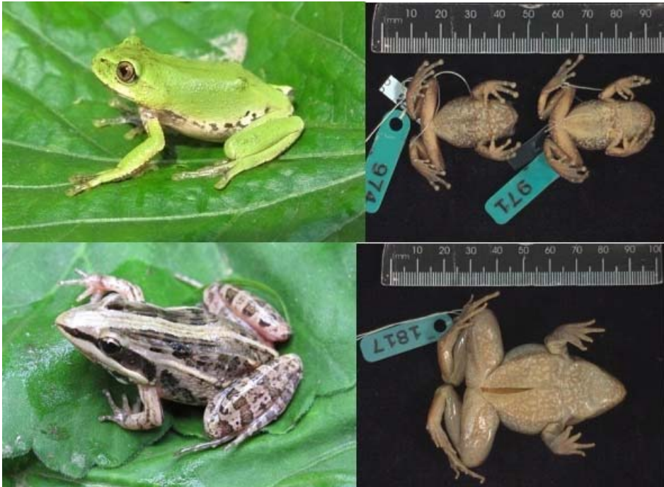
Fig. 4. Top-left: Leptopelis yaldeni from Debre Markos, type locality (AM-016); top-right: ventral view of L. ragazzii , from Ghedo (BM 1976.971 and BM 1976.974); bottom-left: Ptychadena wadei from Andassa, near Tis-Abay area (AM-021); bottom-right: ventral side of P. cooperi , near Bore (BM 1975.1817).

Geographically, the Ethiopian Highlands are home for most of the endemic and threatened species of amphibians as contrasted with the lowlands that have widespread populations of species shared with other parts of Africa. Deforestation, habitat degradation, agriculture and urbanization are increasing and replacing natural forested, grassland and aquatic habitats. The majority of the country's human population also dwells in the highlands. Within the highlands themselves, some areas have been relatively better surveyed than others, and some highland segments have more suitable amphibian habitats than other fragments. These scenarios mean that it is necessary and timely to conduct research on amphibian species in the highland parts of Ethiopia.