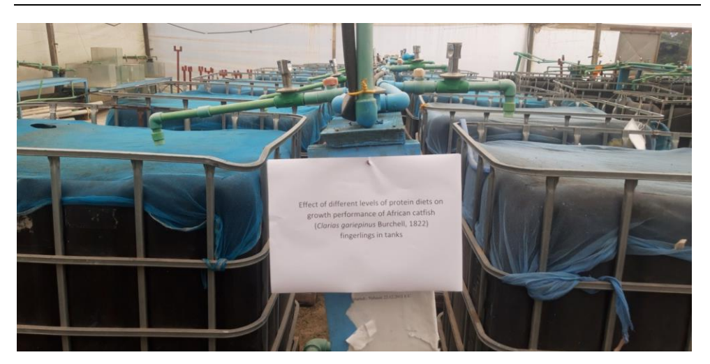
Plate 1. Photo showing the experimental setup of recirculating tanks in green house at NFALRC.

C. gariepinus fingerlings raised artificially in the centre were used for the feeding experiment. The feeding trial consisted of three treatment groups; fed with three feeds of protein diets containing 30% CP, 35% CP and 40% CP. Twelve fish fingerlings having similar sizes were stocked per tank. At the beginning of the experiment total length and total weight of all fish were measured to the nearest 0.1 cm and 0.1 g, respectively. Similarly monthly TL and TW of all fish were recorded and the daily ration was adjusted accordingly. Fish were fed with test diets at 5% of their total body weight for six days a week, except Sundays. The daily ration was given twice a day by hand casting, in the morning (10:00 am) and in the afternoon (4:00 pm). The daily ration was calculated and adjusted regularly following the monthly weight gain of the fish. Mortality of fish was monitored and recorded continuously throughout the experiment.